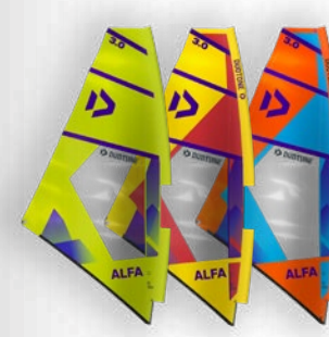
C 2 3 C 2 4 C 2 5

https://www.duotonesports.com/windsurfing/sails/alfa/