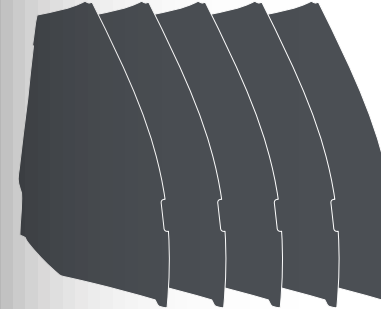
C 12 C 13 C 14 HD RE

https://www.duotonesports.com/windsurfing/sails/s-space/