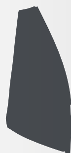
C 1 8

https://www.duotonesports.com/windsurfing/sails/warp-foil-2022/