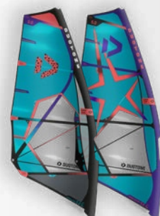
C 07 S 6

https://www.duotonesports.com/windsurfing/sails/idol-ltd/