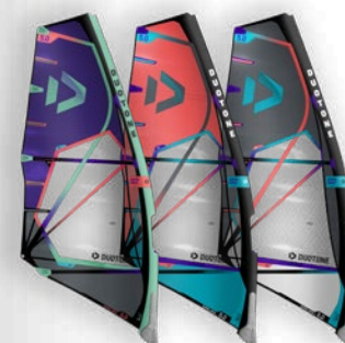
C 01 C 02 H D

https://www.duotonesports.com/windsurfing/sails/super-star-sls/