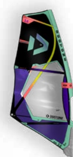
C 1 7

https://www.duotonesports.com/windsurfing/sails/now/