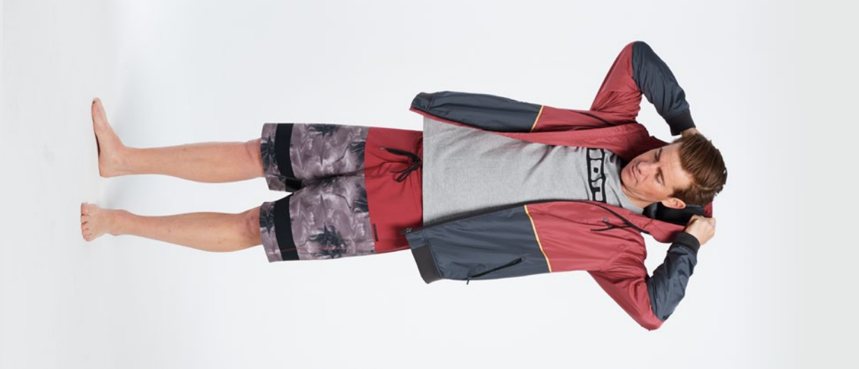
. WINDBREAKER JACKET . TEE SS NEVER TOO OLD . BOARDSHORT S SLADE 19"