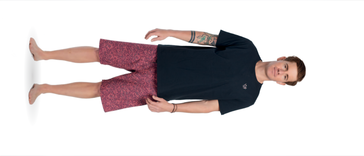
. TEE SS DARK PARADISE . BOARDSHORT S ION LOGO 20"