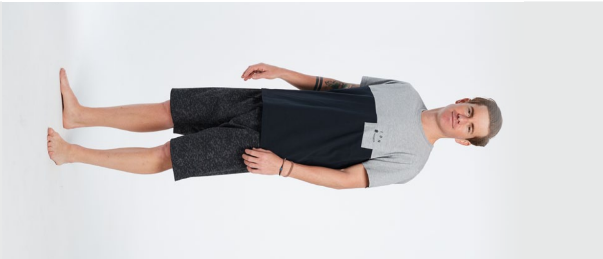
. TEE SS PALM HUGGERS 0C . BOARDSHORTS ION LOGO 20"