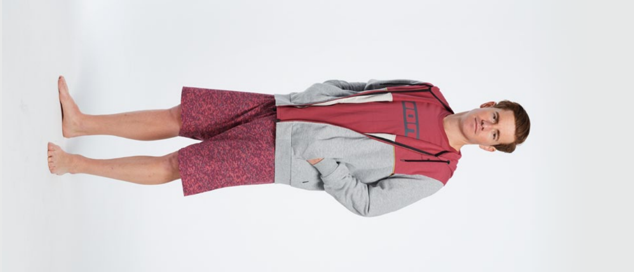
. ZIP HOODY SEVEN PALMS . TEE SS LOGO . BOARDSHORT S ION LOGO 20"