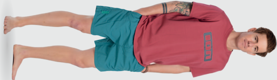
. TEE SS LOGO . VOLLEY SHORTS 17"