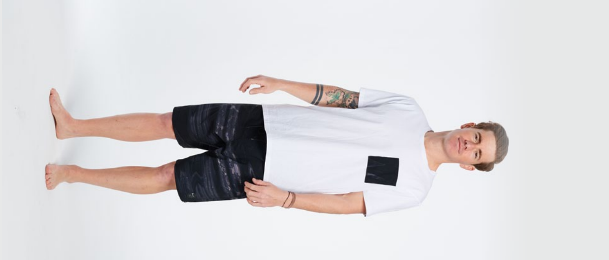
. TEE SS CAPSULE . BOARDSHORTS SLADE CAPSULE 19"