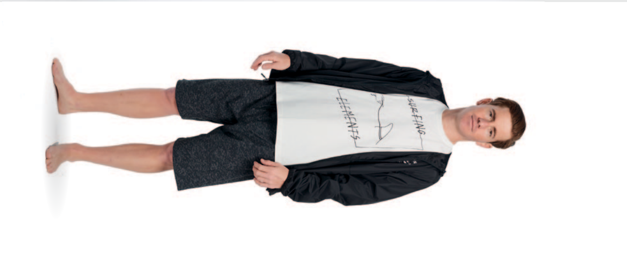
. RAIN JACKET . TEE SS SURFING ELEMENTS . BOARDSHORTS ION LOGO 20"