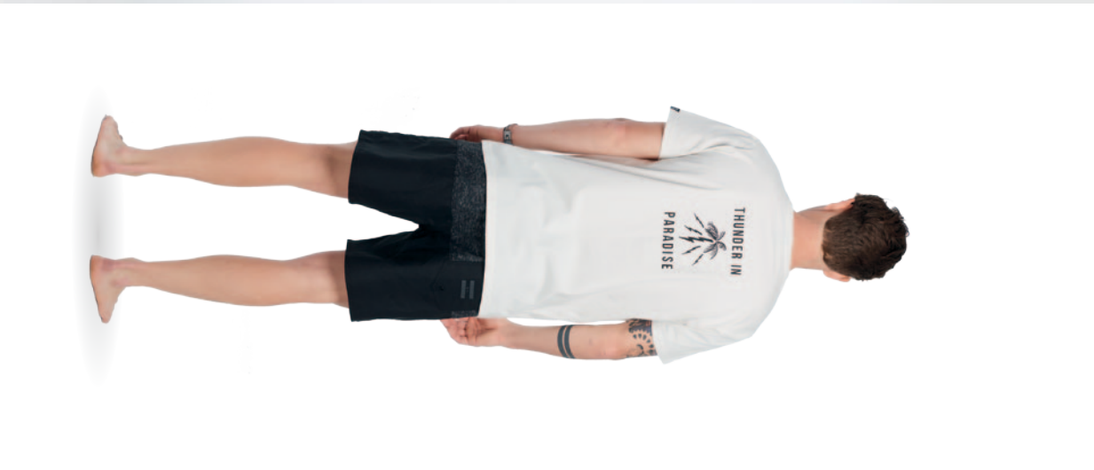
. TEE SS THUNDER IN PARADISE . BOARDHORTS PERISCOPE 17"