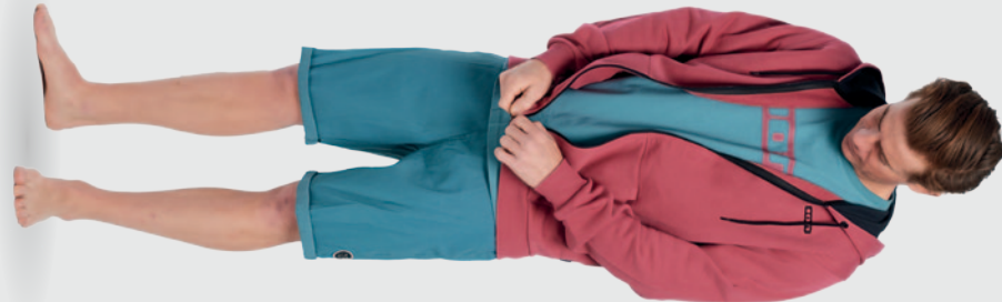
. TEE SS LOGO . ZIP HOODY LOGO . BOARDSHORTS SEVEN PALMS 20"