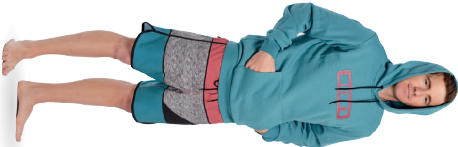
. HOODY LOGO . BOARDSHORTS AVALON 18"