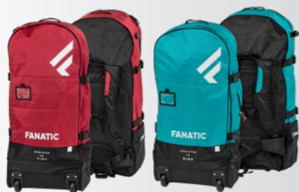
PREMIUM BACKPACK DARK RED / TURQUOISE