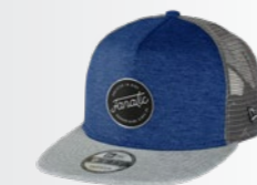
NET CAP BOARDRIDING 13900-5810 HEATHER BLUE S/M, M/L