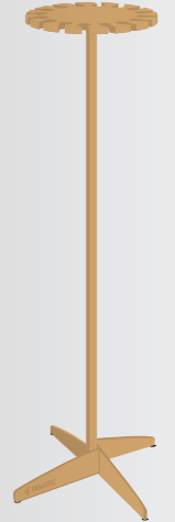
PADDLE RACK BASE & TOP (PART 1) 13200-8530 CENTRAL POLE (PART 2) 13200-8531