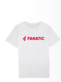
KIDS SHIRT FANATIC 13200-5228 WHITE 5 - 6, 7 - 8, 9 - 11, 12 - 14