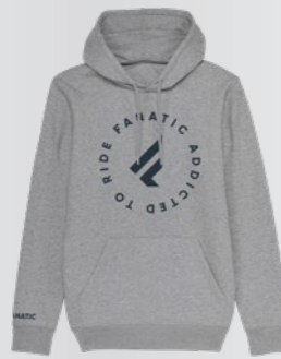
HOODIE ADDICTED 13200-5226 HEATHER GREY XS - XXL