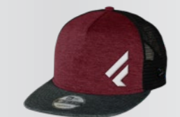
NET CAP F 13200-5814 BURGUNDY S/M, M/L