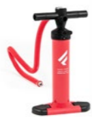
NANO PUMP (DOUBLE ACTION)