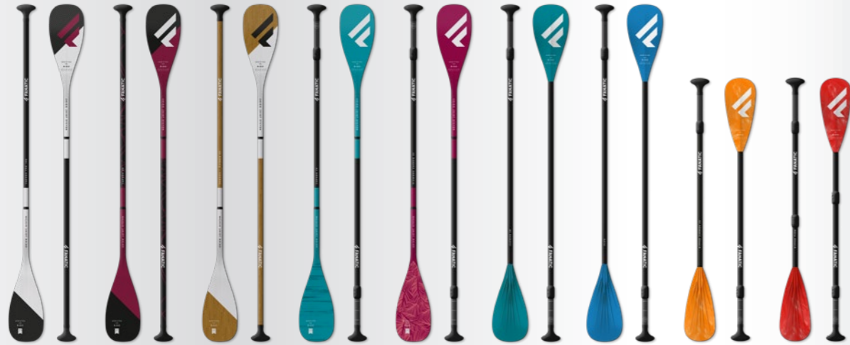
CARBON PRO 100 CARBON 80 BAMBOO CARBON 50 CARBON 35 DIAMOND CARBON 35 CARBON 25 PURE RIPPER CARBON 25 RIPPER PURE