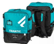
POCKET BAG TURQUOISE