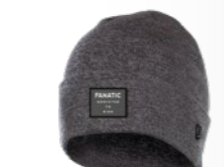
BEANIE ADDICTED 13200-5810 DARK GREY ONE SIZE