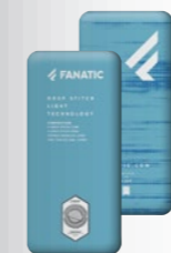
DROP STITCH SAMPLE 13200-8557 DROP STITCH LIGHT