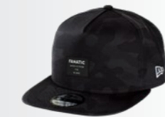
CAP ADDICTED CAMO 13200-5811 BLACK S/M, M/L