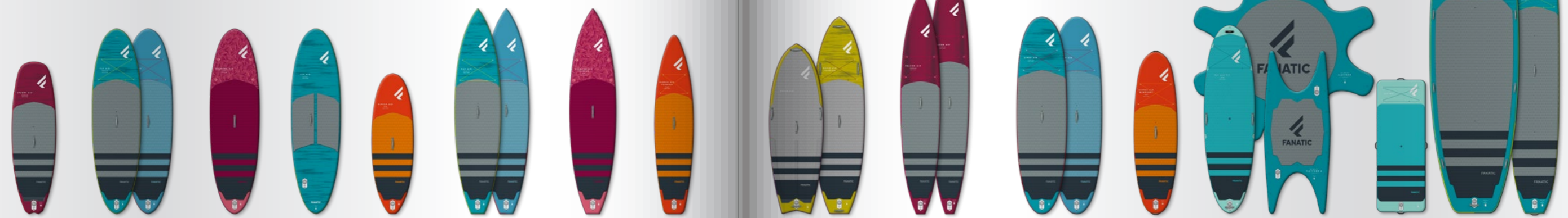
STUBBY AIR FLY AIR DIAMOND AIR FLY AIR POCKET RIPPER AIR RAY AIR DIAMOND AIR TOURING RIPPER AIR TOURING RAPID AIR RAPID AIR TOURING FALCON AIR VIPER AIR RIPPER AIR WINDSURF FLY AIR FIT FLY AIR FIT PLATFORM S AIR MAT FLY AIR XL TANDEM AIR