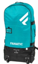
FLY AIR PLATFORM BAG