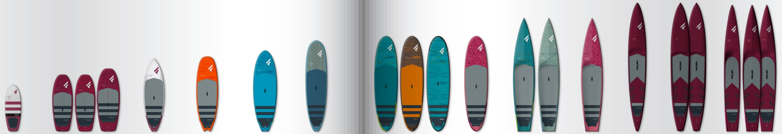
SKY SURF FOIL SKY SUP FOIL PROWAVE LTD STUBBY ALLWAVE STYLEMASTER FLY DIAMOND RAY DIAMOND TOURING FALCON BLITZ STRIKE