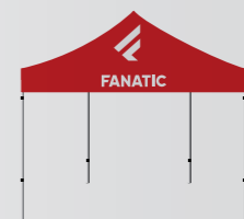
FOLDING TENT FRAME (PART 1) 13200-8552 300 x 300 CM