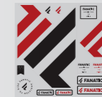
LOGO STICKER SET 13200-8205 MIXED 35 x 35 CM