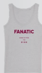
GIRLS TANK FANATIC 13203-5008 CREAM HEATHER GREY S - L