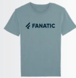
T-SHIRT LOGO 13202-5022 CITADEL BLUE S - XXL