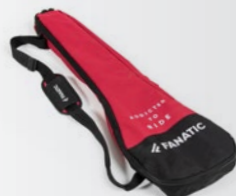
PADDLE BAG (FOR 3-PCS. PADDLES)