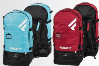
PURE BACKPACK BLUE / DARK RED