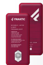
DROP STITCH SAMPLE 13200-8557 DOUBLE LAYER LIGHT