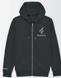
16 ZIPPED HOODIE FANATIC 13200-5225 DARK HEATHER GREY XS - XXL