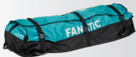
FLY AIR XL BAG