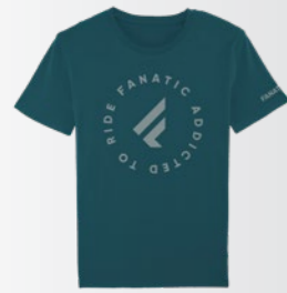
T-SHIRT ADDICTED 13202-5020 STARGAZER S - XXL