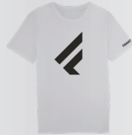
T-SHIRT F 13202-5021 WHITE S - XXL