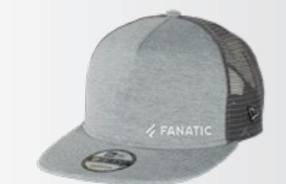
NET CAP FANATIC 13200-5813 LIGHT GREY S/M S/M, M/L