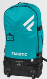
FLY AIR PLATFORM S BAG