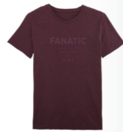
T-SHIRT FANATIC 13202-5023 HEATHER GRAPE RED S - XXL