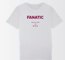
GIRLS SHIRT FANATIC 13203-5025 WHITE S - L