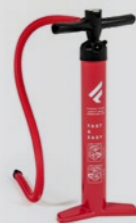
POWER PUMP HP2 (DOUBLE ACTION)