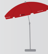
BEACH UMBRELLA 13800-8521 BEACH UMBRELLA STAND 13800-8522