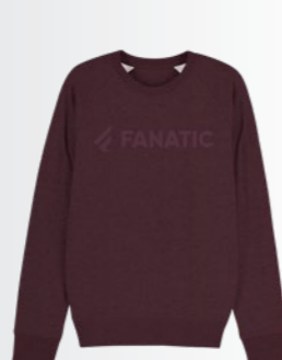
SWEATER FANATIC 13200-5227 HEATHER GRAPE RED S - XXL