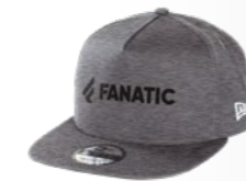
CAP FANATIC 13200-5812 DARK GREY S/M, M/L